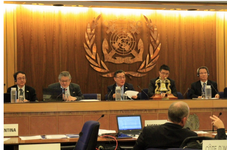
Lunchtime presentation at IMO MSC98